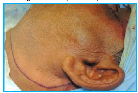
Fig. 4: Submandibular incision with posterior extension