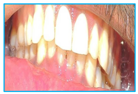
Fig. 1: Slightly deviation of mandible towards right side with ipsilateral open bite